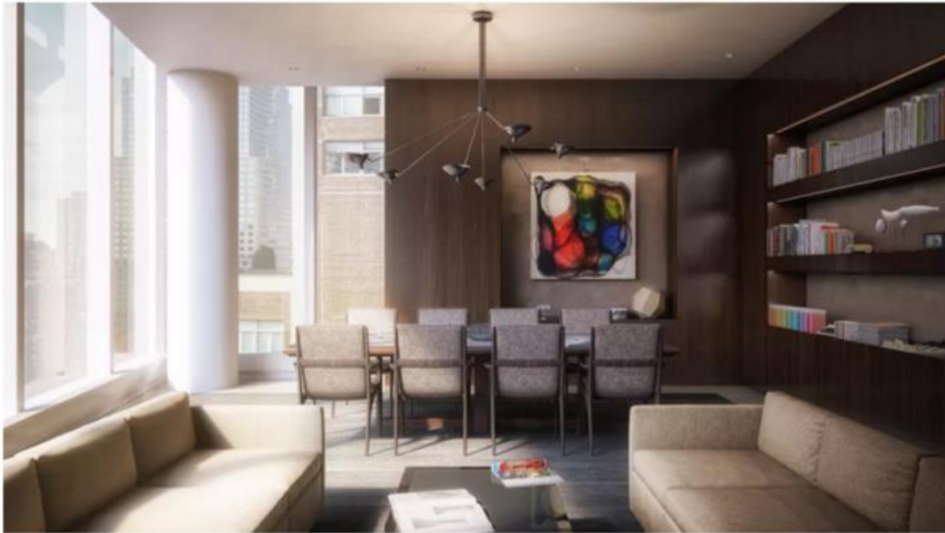
The resident's library.