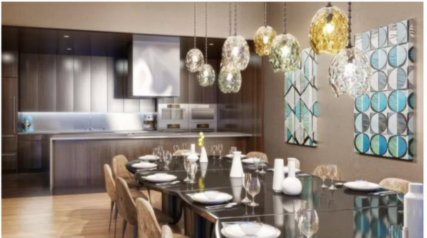
The resident dining room.